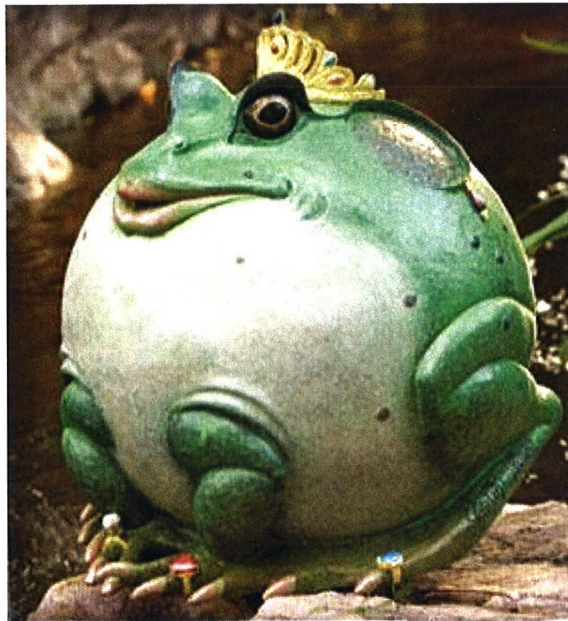
Don't be puffed up!

The worst kind of inflation is not money inflation, but people inflation. Paul wrote to the Corinthians and said, "Now some are _____" (blown up, inflated with pride—1 Corinthians 14:18; see also 1 Corinthians 14:6; 5:2; 13:4). Such people put a value on themselves which greatly exceeds their true value and worth. There is an unhealthy increase in the quantity of exalted thoughts about themselves. In Romans 12:3 believers are warned not to think of themselves M_____ H_____ than they ought to think. Those who are inflated (1 Cor. 8:1) think that they know something, when in reality they know _____ (1 Cor. 8:2). The inflated person thinks that he is S_____ when he is really N_____ (Galatians 6:3).