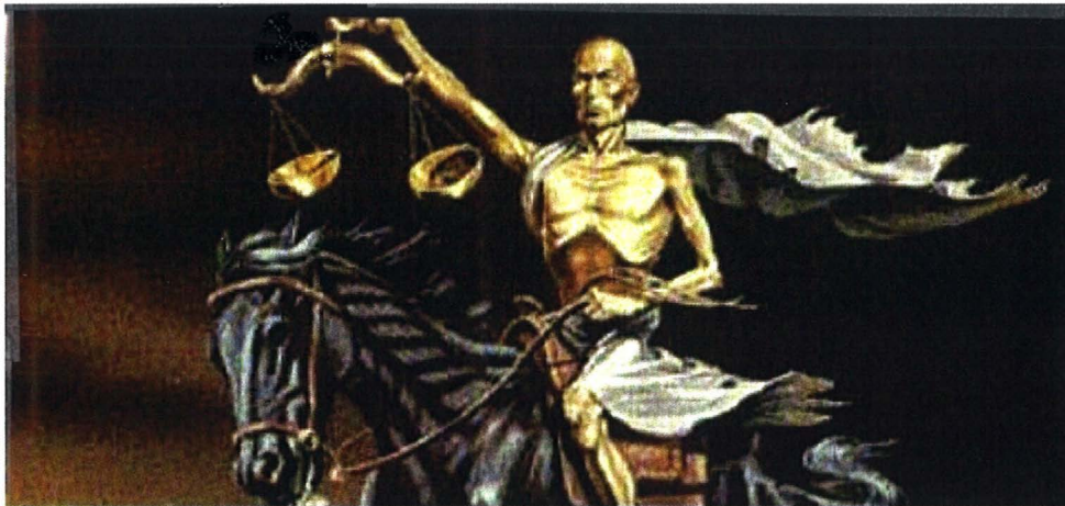
The Third Seal Judgment of Rev. 6:5-6

Everyone has experienced the results of inflation! We experience inflation when we visit the grocery store and milk costs 10 or 15 cents more than it did the previous month. Or we stop at the gas station and discover that the price for a gallon of gas has gone up again. The price of a home which sold for $100,000.00 twenty years ago might cost more today. The price for a new car may increase, so that the purchaser is paying more money today than he would have paid a few years earlier for basically the same car.